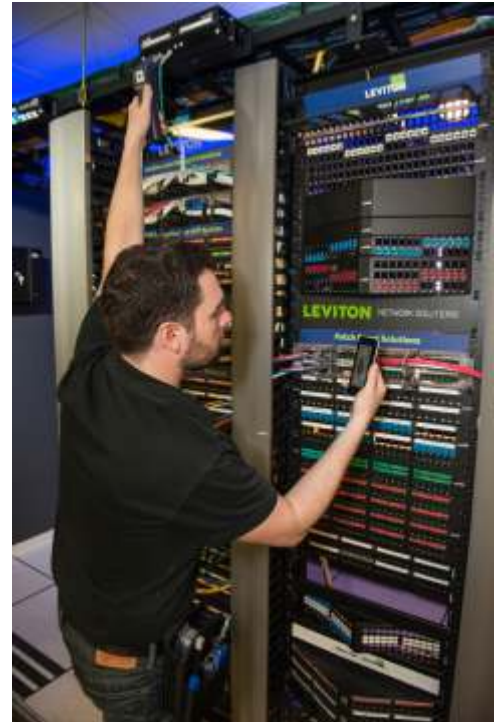
Reading FiberChek probe results on a smartphone