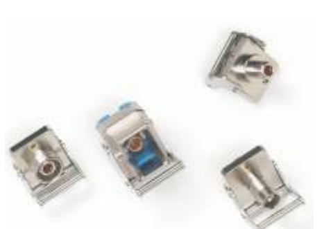
Optical adapters (BN 2150) for laser source output

Wheel for precise and fast manual setting >