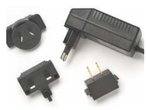
Worldwide compatible AC adapter (SNT-121A)