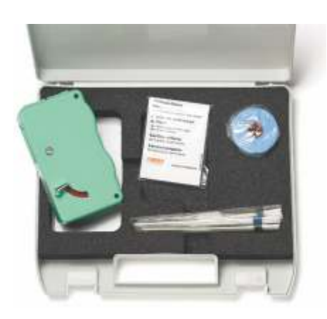
OCK-10 Optical Connector Cleaning Kit (accessory)