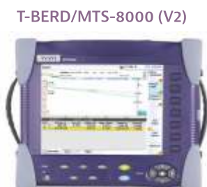
Scalable platform for multilayer and multiple-protocol testing