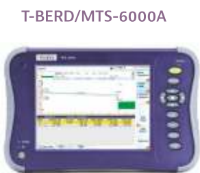
Compact multilayer platform for network installation and maintenance