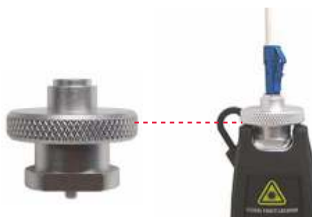
Universal 1.25 mm adapter for FFL-100