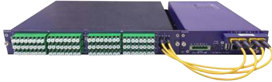
OTU-5000 with a 48 port (Test Access Point) TAP and 48 port MPO switch